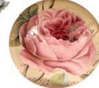
Paperweight, £65 John Derian at Trouva