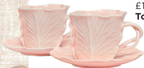
£100 a pair Tory Burch