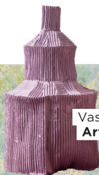
Vase, £535 Artemest