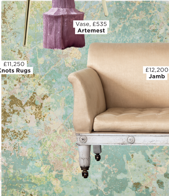
£11,250 Knots Rugs