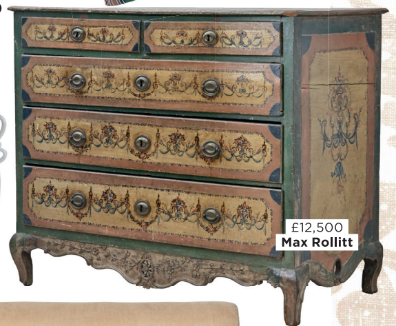
£12,500 Max Rollitt