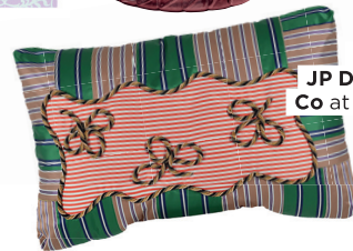
£670 JP Demeyer & Co at Alex Eagle