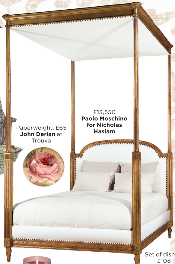
£13,550 Paolo Moschino for Nicholas Haslam