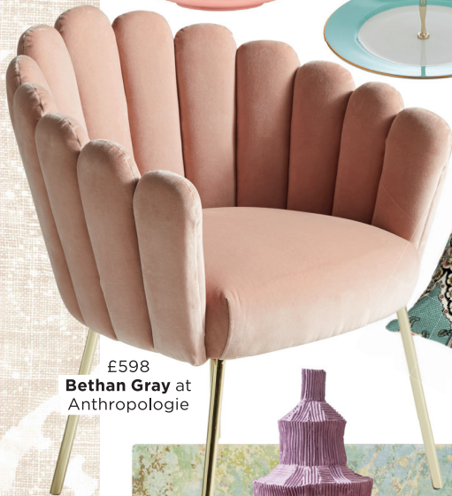
£598 Bethan Gray at Anthropologie