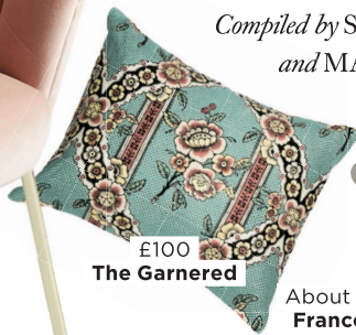
£100 The Garnered