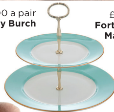
£125 Fortnum & Mason