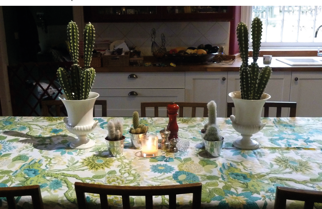
Prickly customers: a coven of cacti nestle in floral print tablecloth splendor in the kitchen

of Totty's design aesthetic. In the colourful snug next door, a table is laden with samples she is gathering for a forthcoming project; florals sit with stripes and geometrics, gilt with wood, glass with cotton