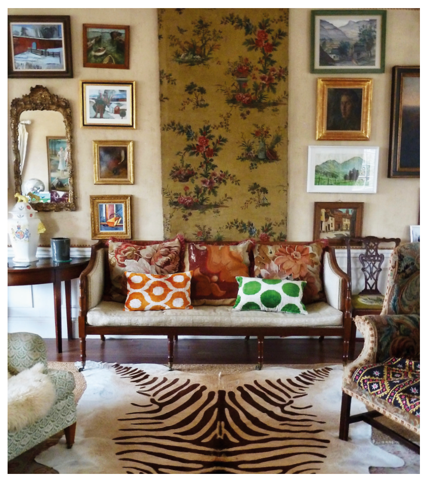
Animal magic: plush cushions, print rugs and original hessian wallpaper from the 1970s, all artfully arranged

addition to the house, is a vast and versatile space and the most perfect party room. Filled with a wonderful array of furniture and paintings, and flooded with natural light, it is hard to know where to look, until your eyes rest on the real scene stealer,