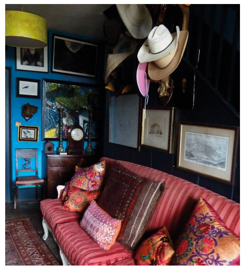
Deck the hall: vivid colours, contrasting textures and interesting prints make a welcome entrance to the farmhouse

evident as soon as you arrive at Whitbysteads. The hall is painted a Cerulean blue and hung with an array of paintings and prints. A pair of antlers, festooned with all manner of hats, hangs above an baroque sofa, its opulence