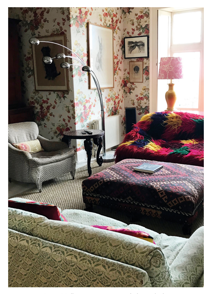
Baroque'n'roll: an eye-popping mixture of colours and styles make the Drawing Room perfect for parties